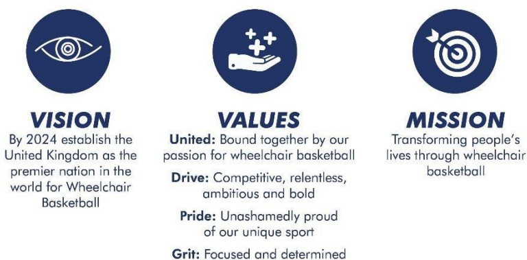
Diagram 1 BWB's Vision, Values and Mission 2019-2024

Whilst the new strategic direction for the organisation will see the sport drive ground-breaking changes to disability sport, the lifeblood of the sport and its passion for transforming lives remains at its heart. The ability to provide life changing experiences through the unique inclusive nature of the sport is intrinsically reinforced by the values instilled throughout the organisation and the sport as a whole.