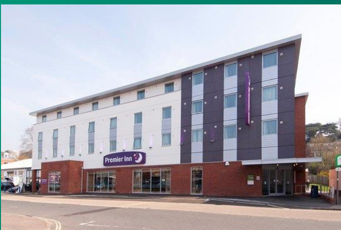
Premier Inn, Exeter St Davids